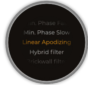
Digital filter selection