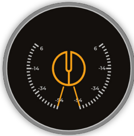
Right and left channel VU meters