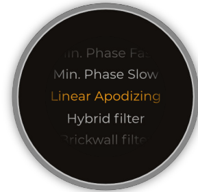
Digital filter selection