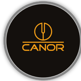
CANOR screen saver

For the first time ever in our product, we implemented a touch display in Virtus A3. The intention was to bring a whole new way of interaction experience with a CANOR device. The display offers all the features and settings accessible with just a finger tap. The UI works exactly how you would expect with a rotary knob all around the display making it as simple as possible to control Virtus A3.