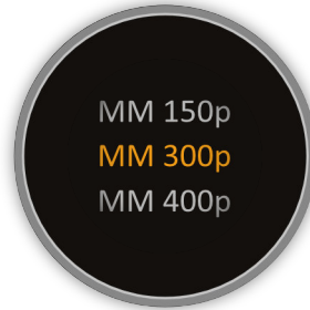
Load capacity MM and input capacitance selection